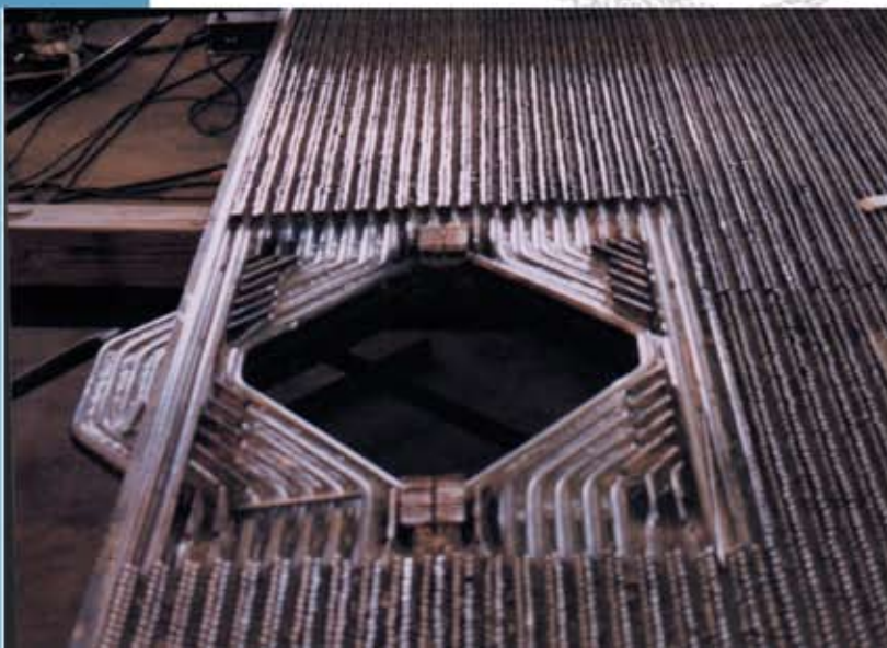
◀ Studded floor panel with slag tap opening for cyclone boiler.

*This facility handles all boilers related inquiries