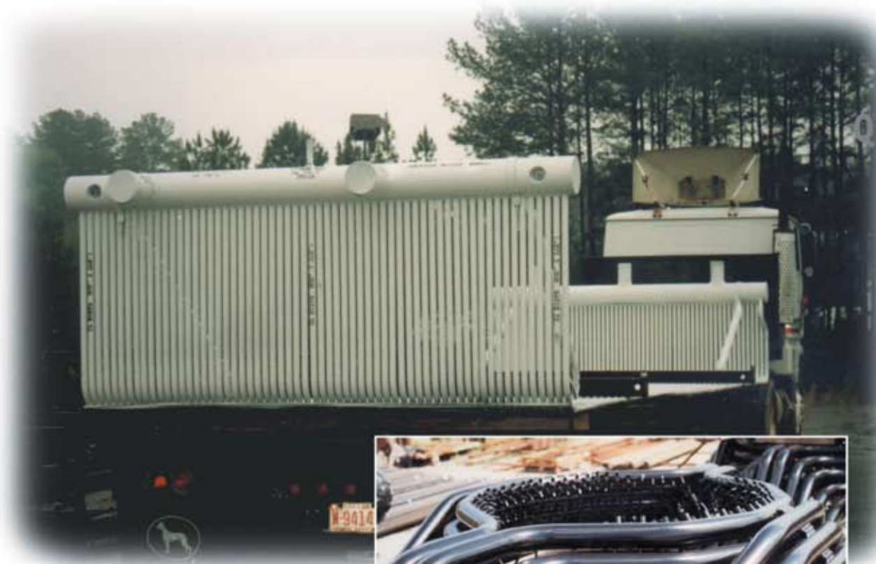
Floor panel for Cyclone Boiler being shipped from our Charlotte, NC division

Meeting Customers' Needs with Quality Products Since 1914