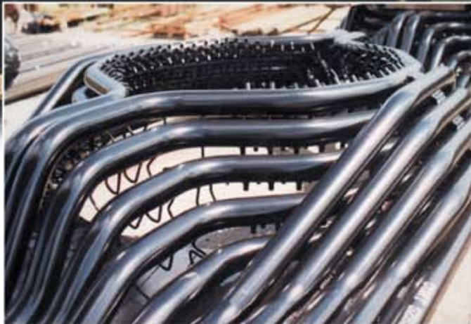
Cyclone re-entry throat