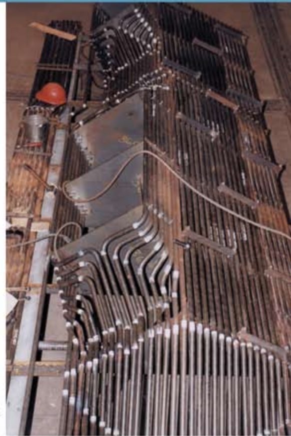
▲ Corner fired panel reverse engineered

P anels are among the most difficult products to manufacture, which is why experience is a key factor in selecting your vendor. Our history with this product line is extensive as our customer list will show. We have manufactured panels for all types of boilers including package, large industrial (including recovery type units) and utility boilers. Types of panels include flat, side waterwall, lower couton bottoms, arch, R.O.burner panels, corner fired units, cyclone units, low NOx conversions, over fired air ports, and other openings like sootblower and observation ports. Waterwall panels are assembled by using the high speed submerged arc process that provides high quality or meets or exceeds industry standards including the fusion welded process.